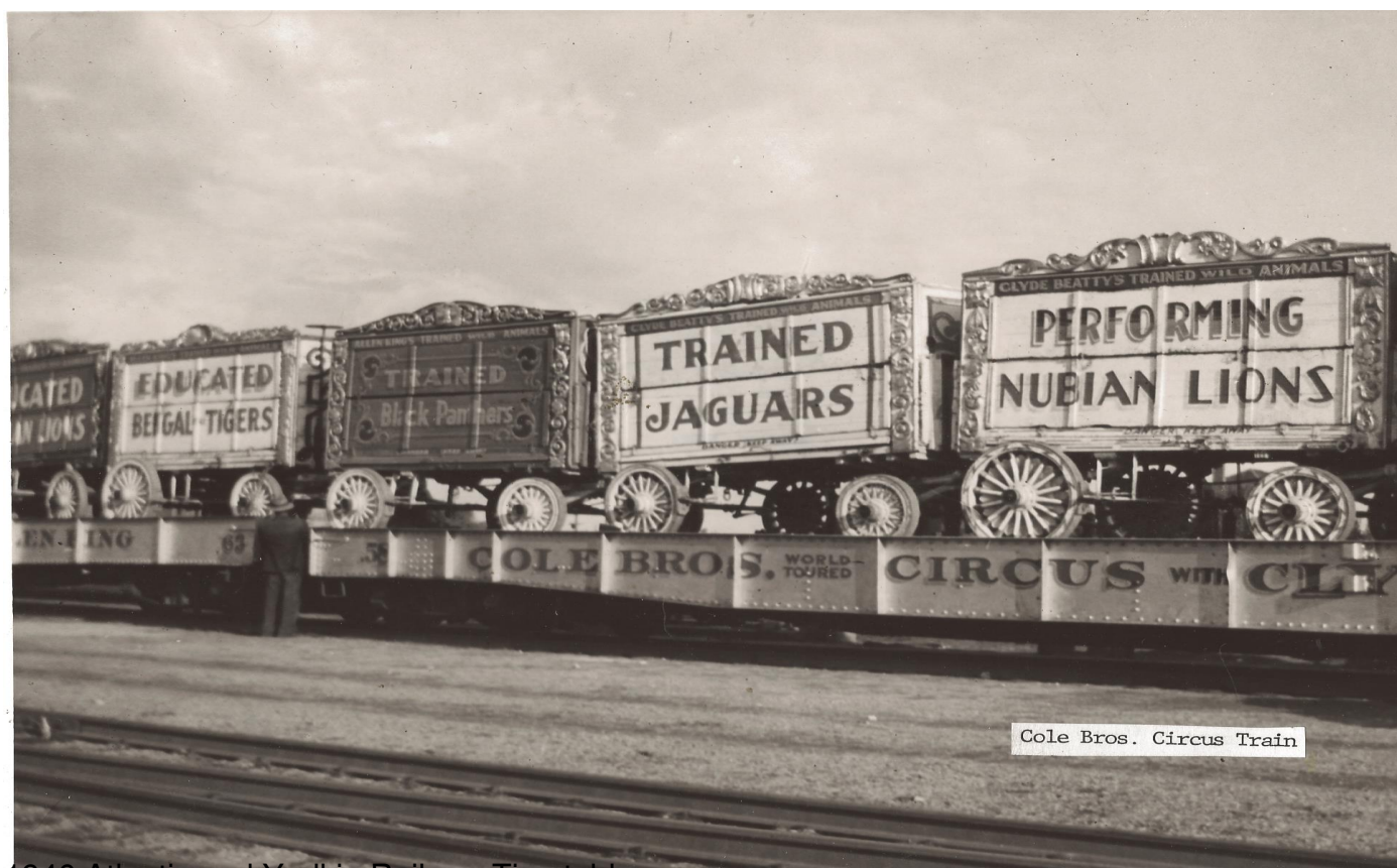
1946 Atlantic and Yadkin Railway Timetable