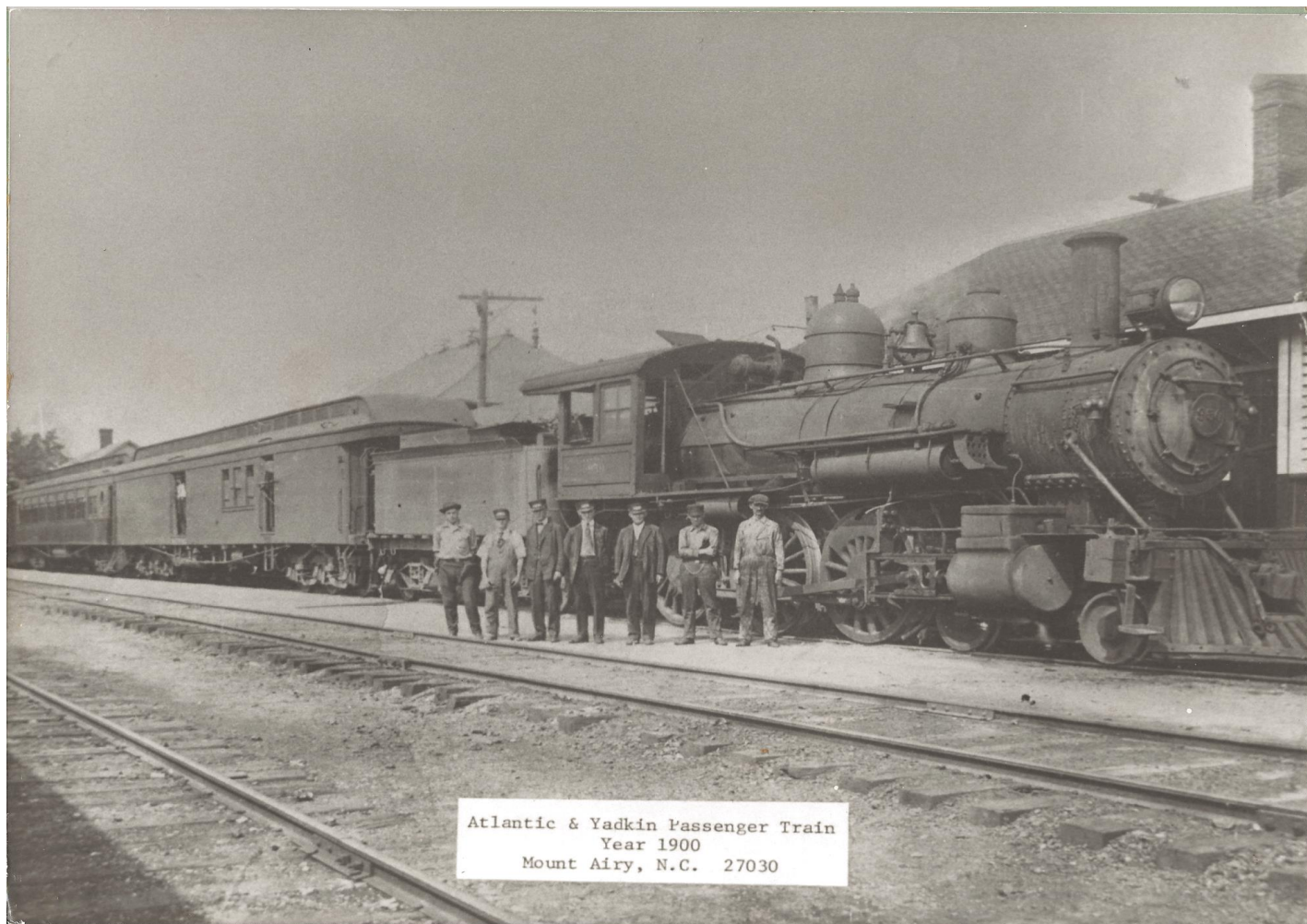
Circus Train coming to Mount Airy