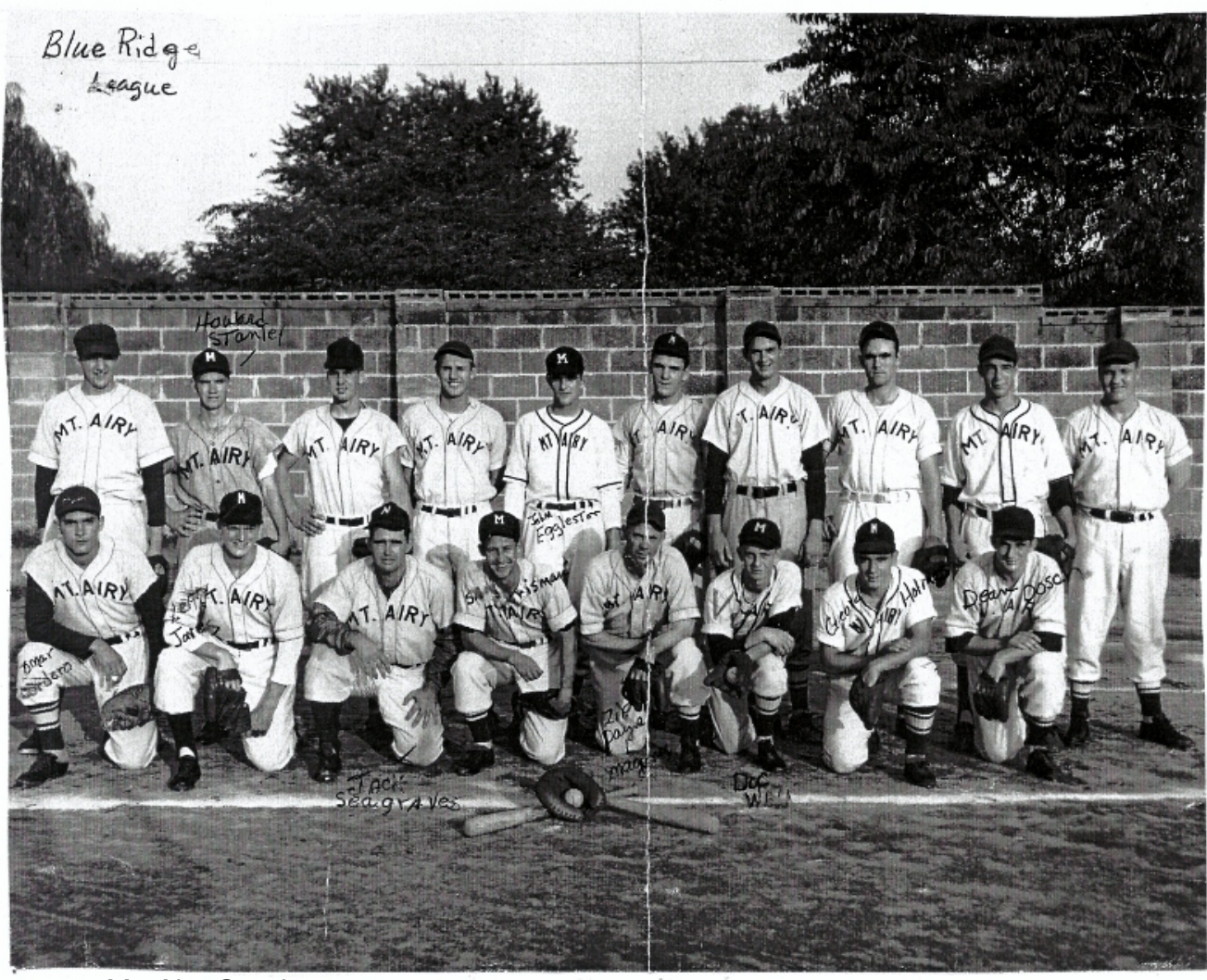
1948 Mt. Airy Graniteers